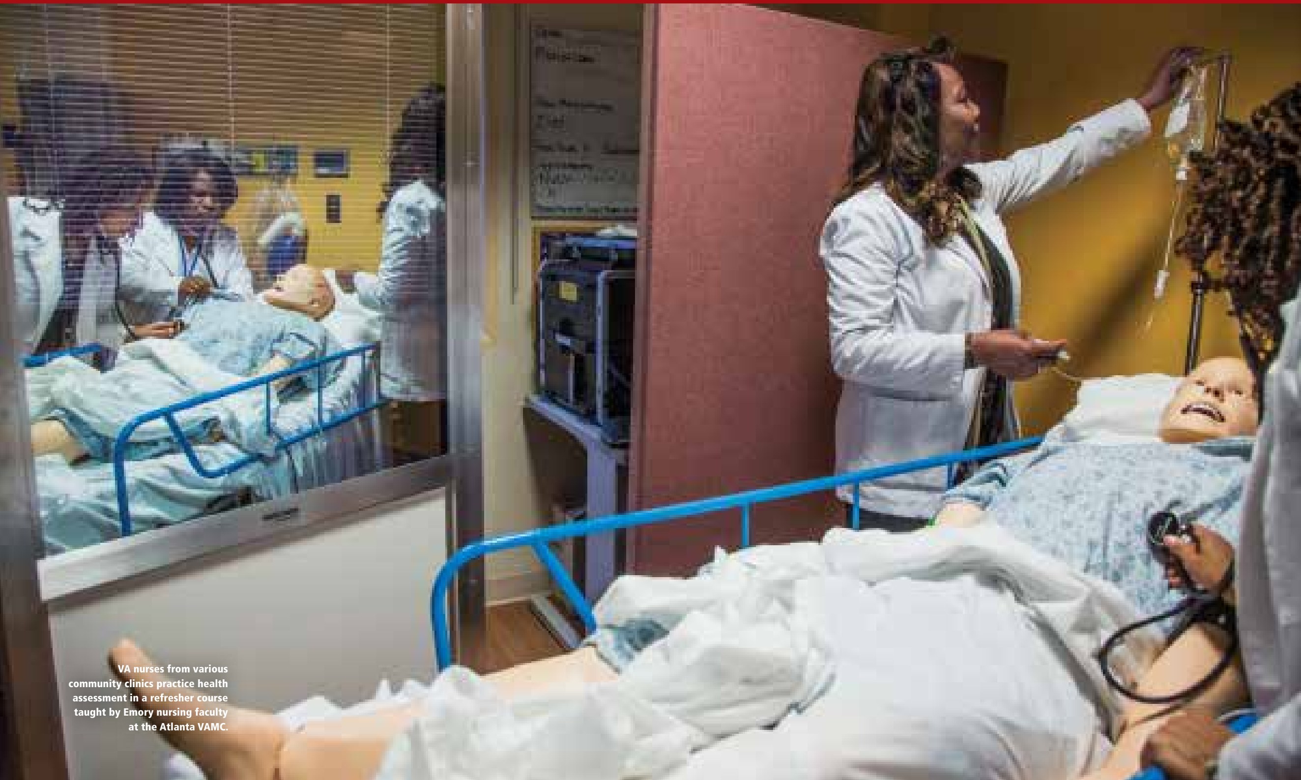
VA nurses from various community clinics practice health assessment in a refresher course taught by Emory nursing faculty at the Atlanta VAMC.

That notion is being infused more deeply into the nursing curriculum via two programs led by Emory nursing faculty and Atlanta VA Medical Center (VAMC) nurses. The programs provide specialty education in veteran care for BSN and MSN students, respectively, and create new faculty positions held by VAMC nurses who train academically at the School of Nursing. They are funded with separate awards totaling nearly $10 million from the U.S. Department of Veterans Affairs