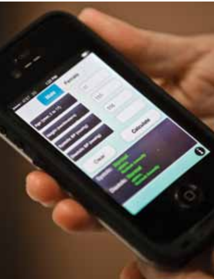
The Pedia BP app now features an auto-clear button to speed up data deletion between screenings, based on feedback from students.